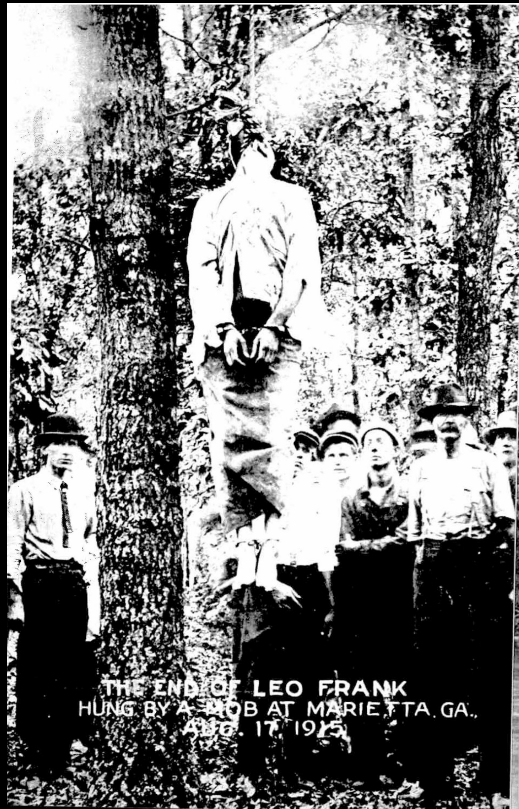
THE END OF LEO FRANK HUNG BY A MOB AT MARIETTA, GA., AUG. 17, 1915