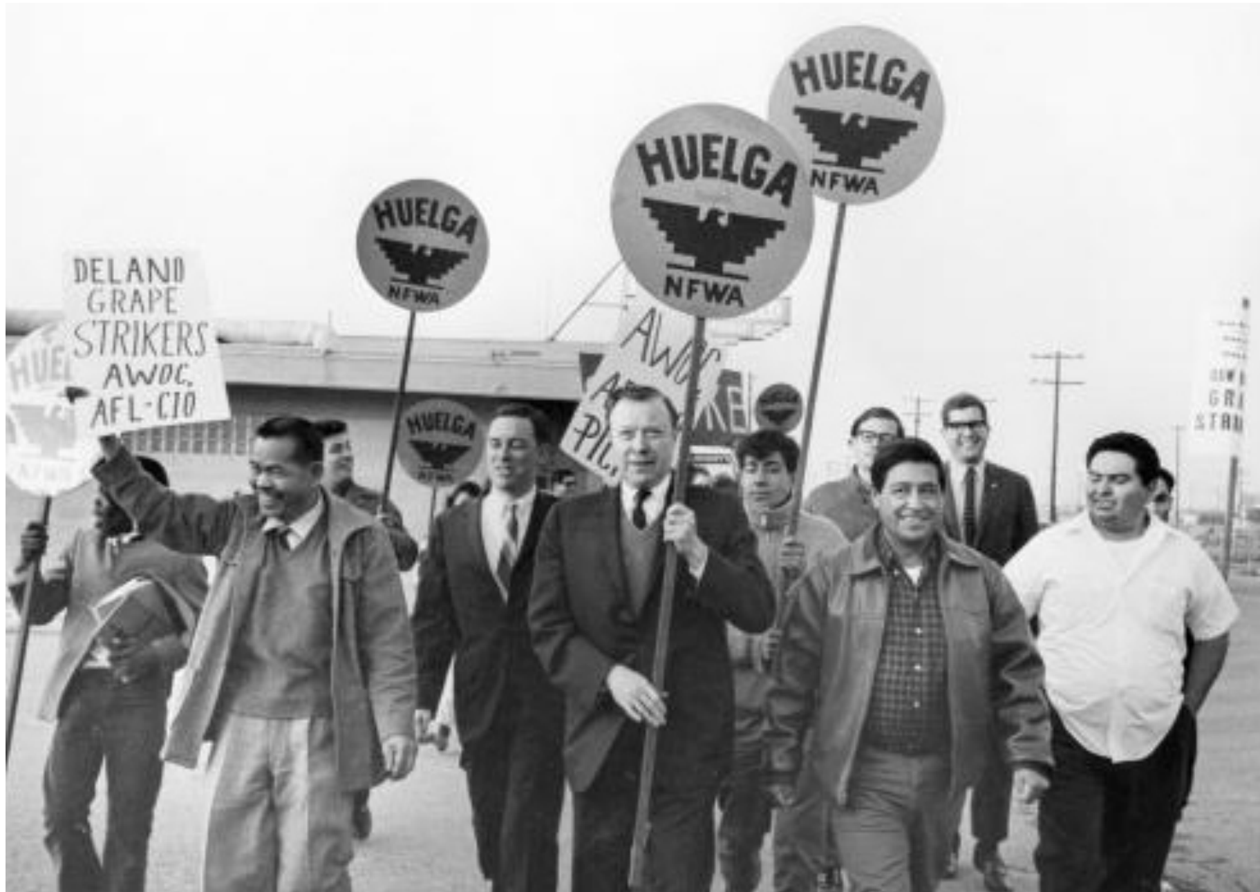
Delano Grape Strike, César Chávez United Farm Workers