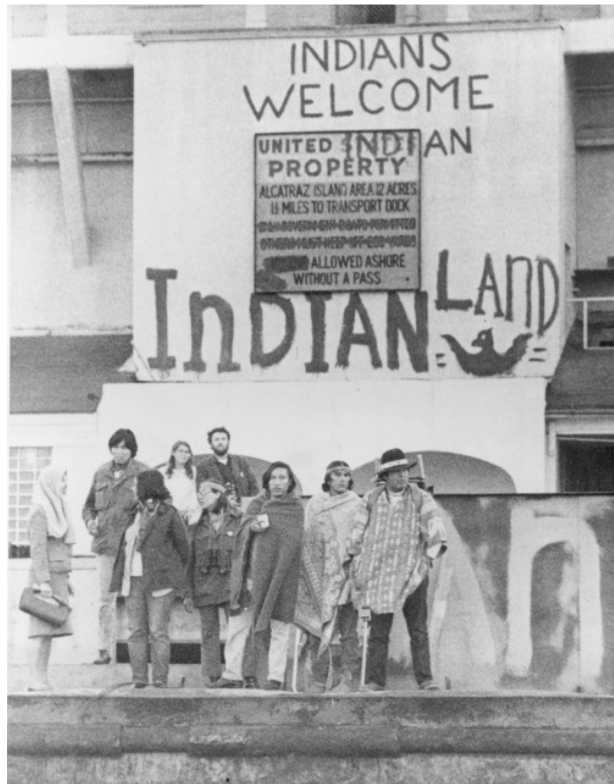
Indians of All Tribes, Alcatraz, 1969-71