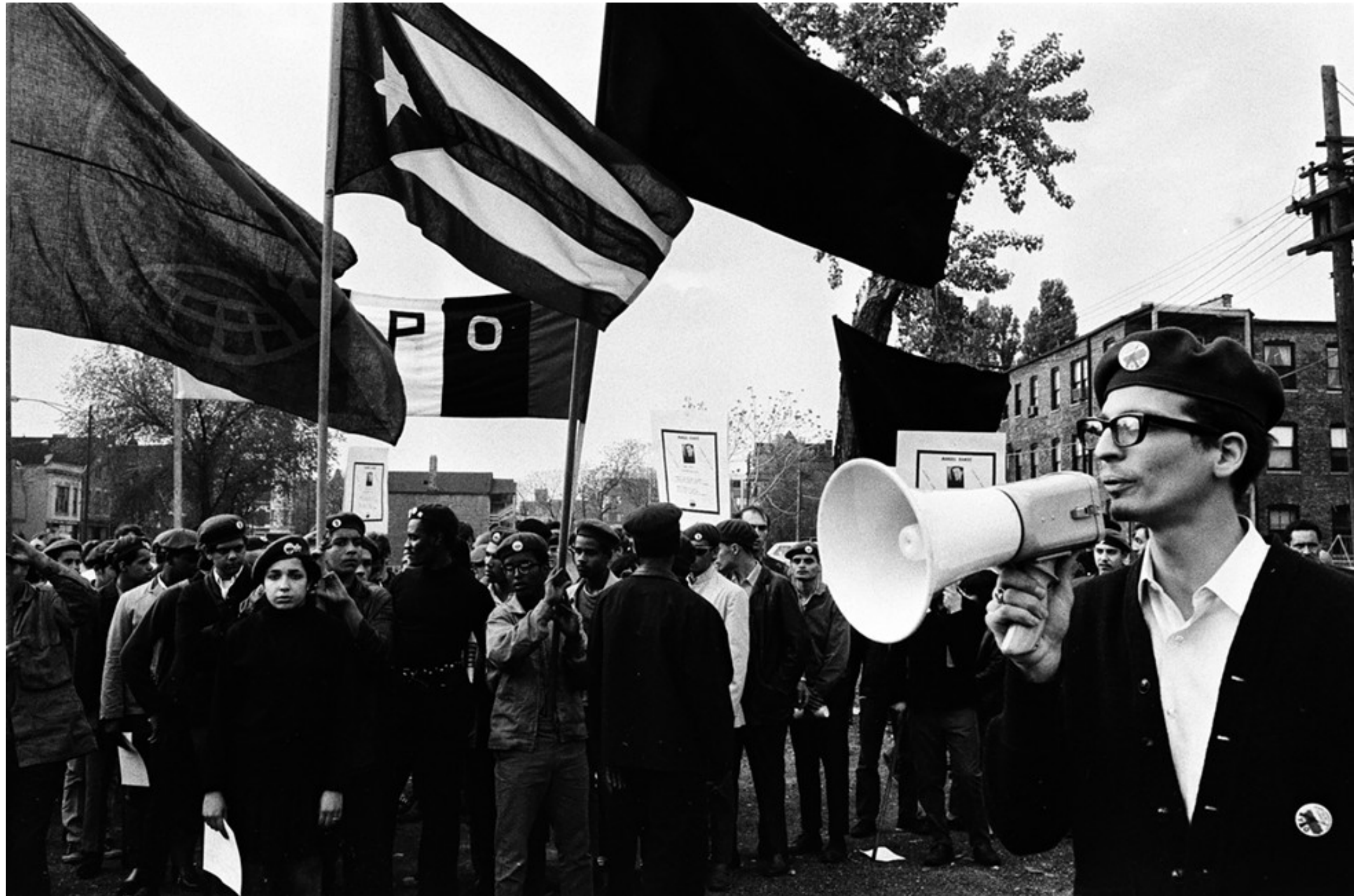
Young Lords Organization Rainbow Coalition (Fred Hampton)