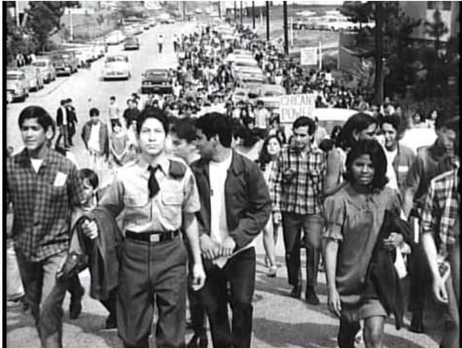
School Walkout, Los Angeles, March 1968