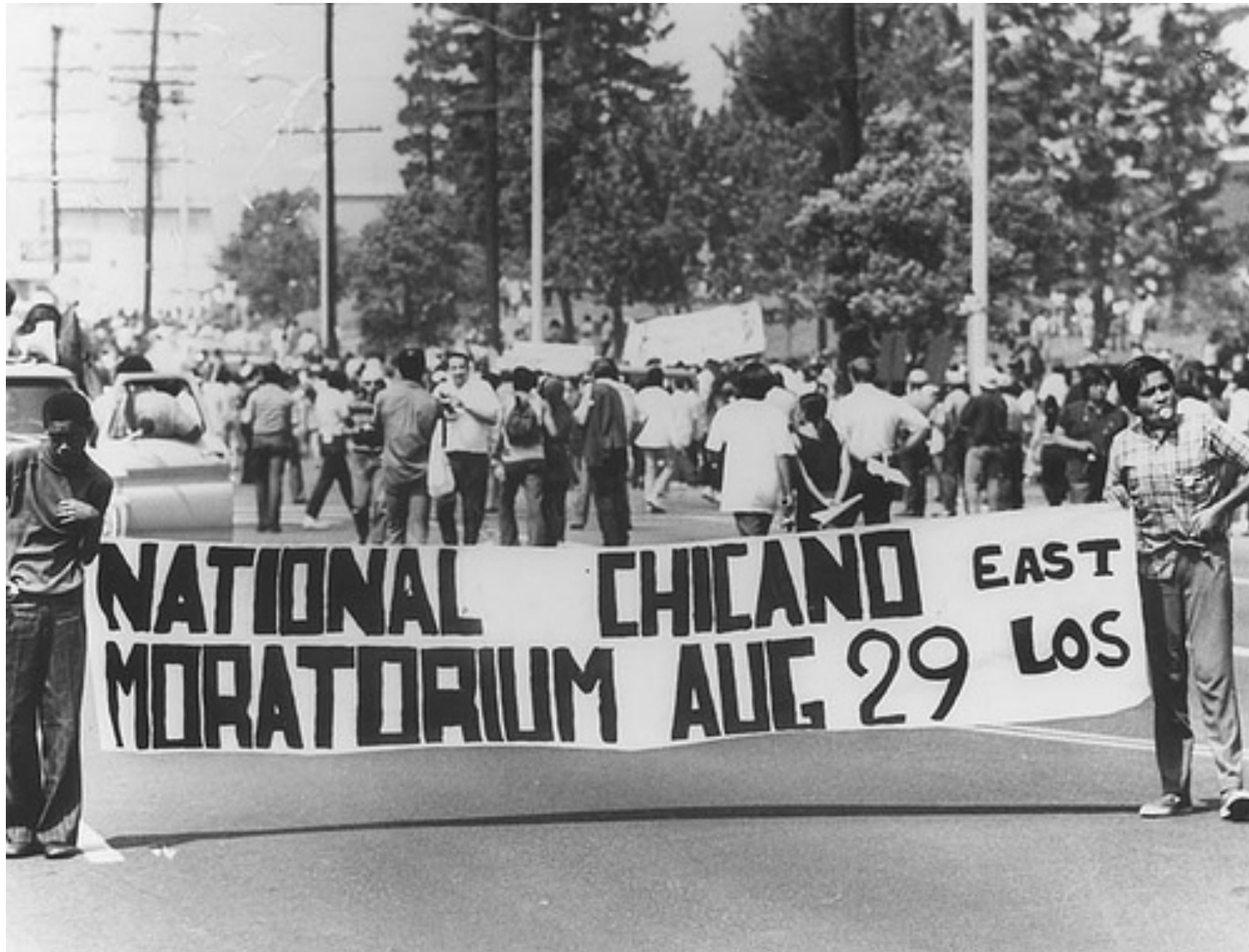
Chicano Moratorium, August 29, 1970