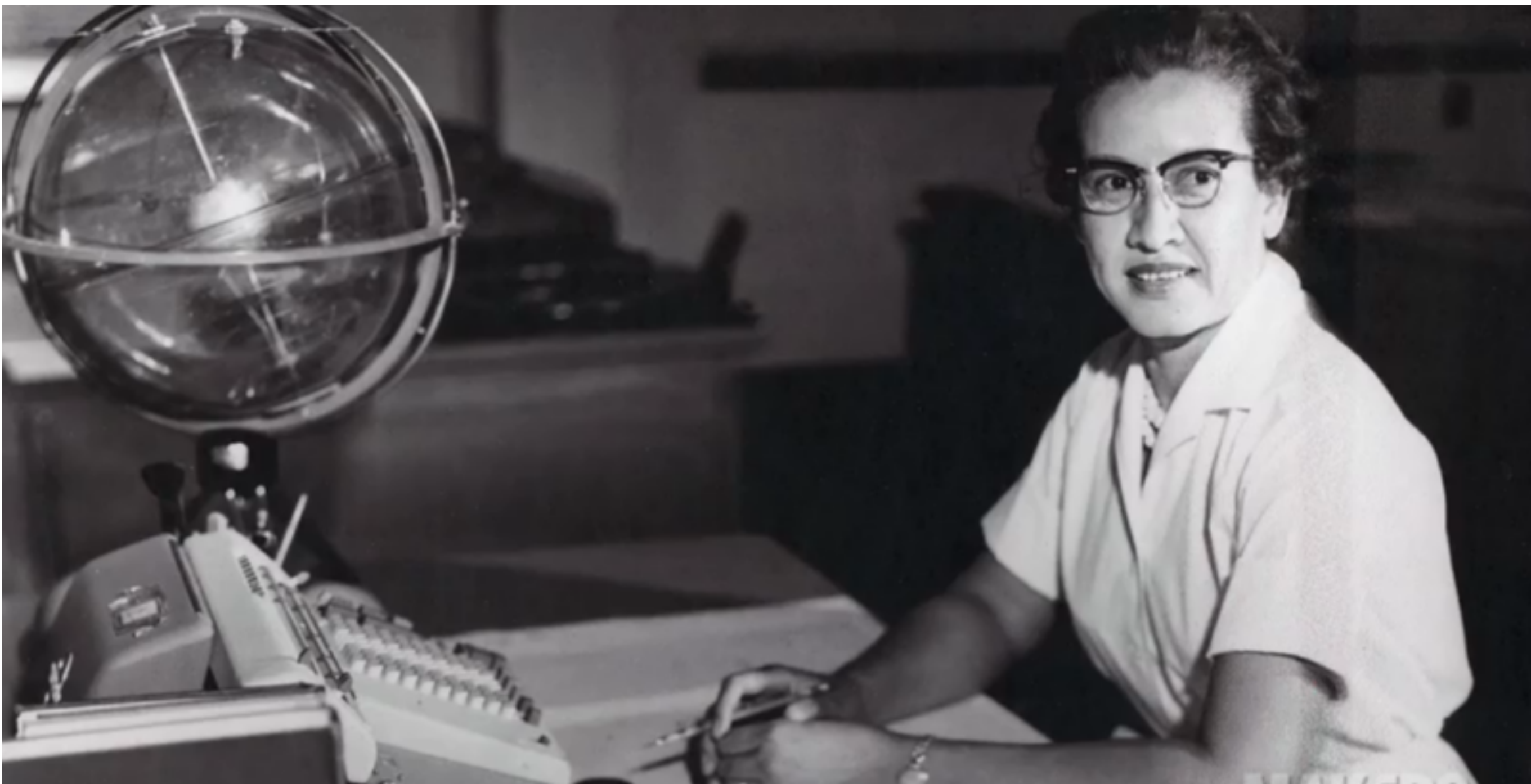
Katherine Johnson, 1918-2019