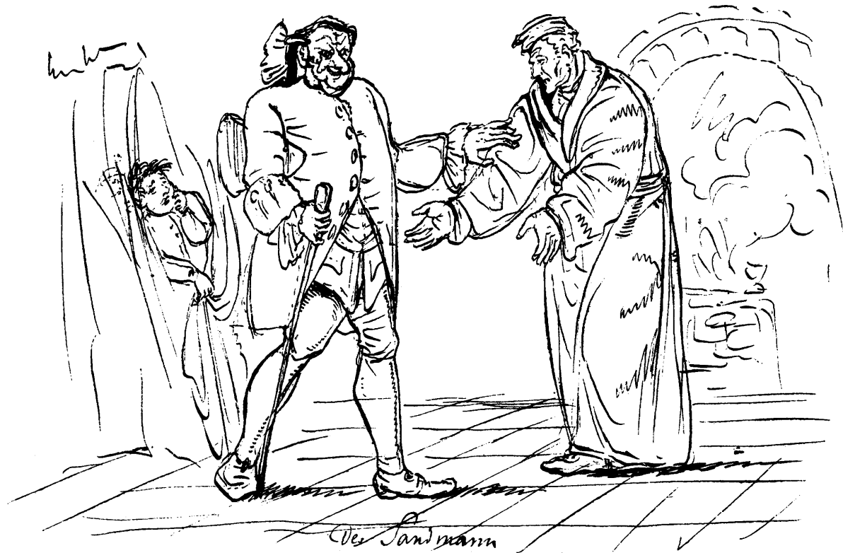
Nathanael eavesdrops on Coppelius