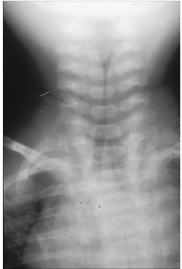
Figure 1. Tapered subglottic narrowing of the airway on radiography, demonstrating the classic "steeple sign" in croup.

In acute epiglottitis, the important differential points on clinical examination are lack of a croupy cough, drooling, toxic appearance, growing anxiety and apprehension, a sitting posture with the chin pushed forward and refusal to lie down, and on inspection, the presence of a cherry-red epiglottis. In contrast, the child who has acute laryngotracheitis will have a barking cough, be comfortable supine, and be less apprehensive. On visual inspection, the epiglottis appears normal. Lateral neck and chest radiographs have been used to help make the diagnosis, but they usually are not recommended when epiglottitis is suspected because of the tenuous condition of these patients. When epiglottitis is suspected, the